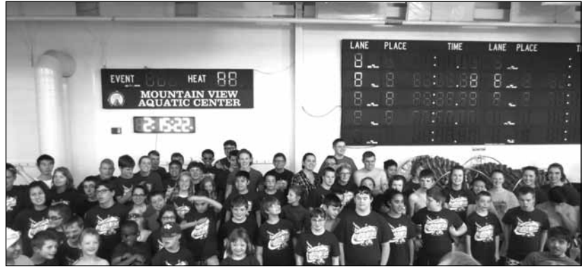
FAST FINS Swim Meet in October – eight teams, one pool, great fun!

MVP BooBQue, hosted by the Knights of Columbus and Holy Cross Catholic Church was a bootiful day with lunch, games, and music therapy for our medically fragile children and their families.